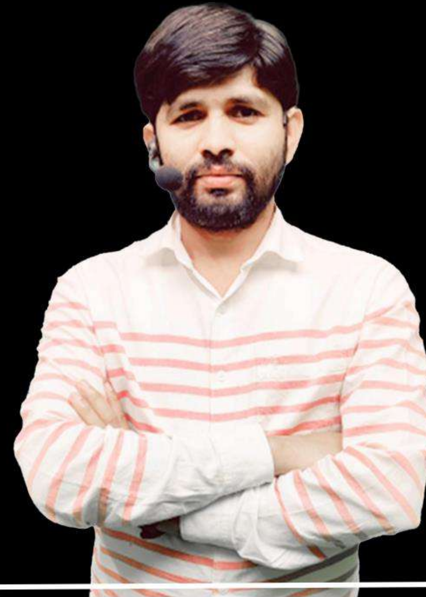
By: P.K Sir